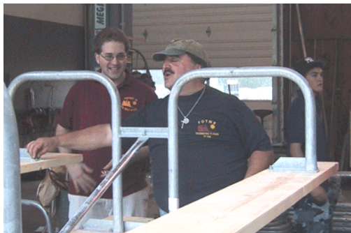
FoTMR members providing service to the Camp at the annual Memorial Day Weekend Service Outing