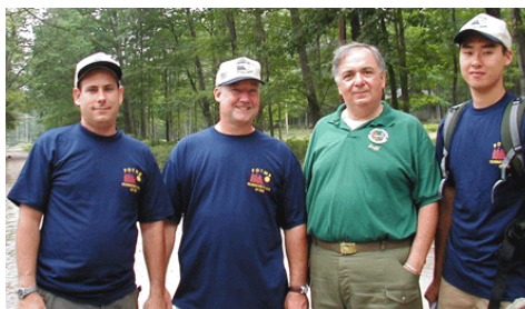
FoTMR Members Perform a Recent Post Camp Inspection