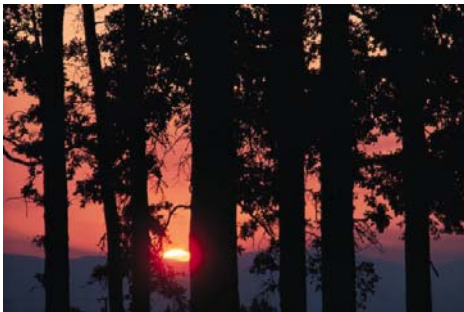
Sunset on Eagle Rock Camp Keowa, Ten Mile River